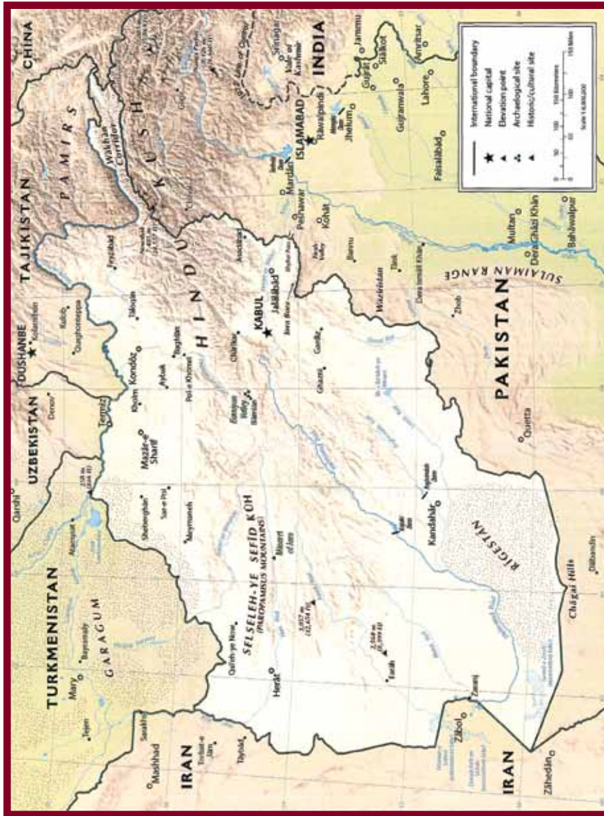
LAMBERT CONFORMAL CONIC PROJECTION; STANDARD PARALLELS 30°25'N 37°10'N 803282A1 (G00875)1.08